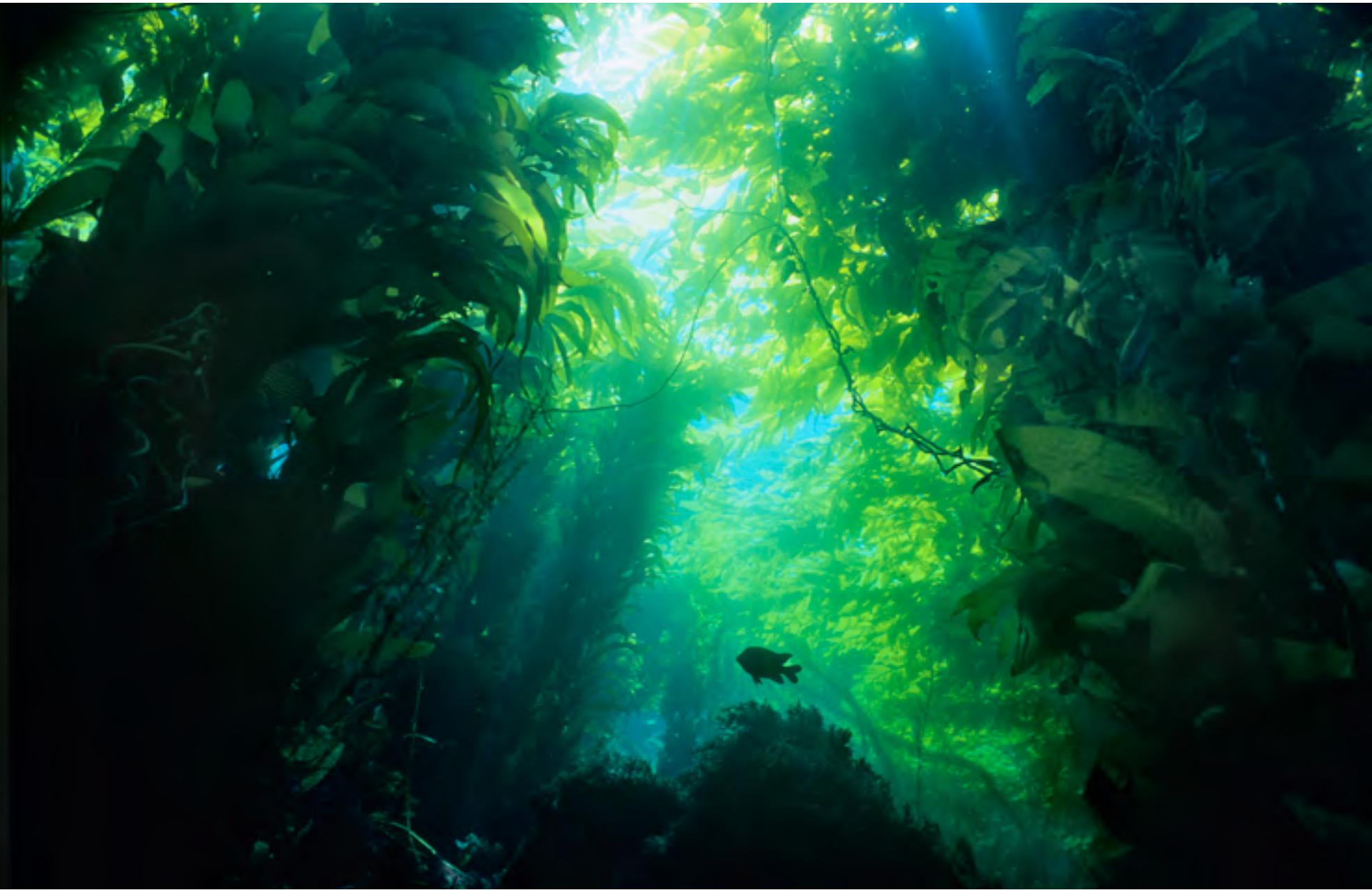
Bruce Hall, Silhouette ( Underwater Series ), photograph, from Sight Unseen